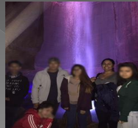
Ruby Falls in Tennessee