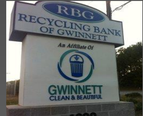
Keeping Georgia clean (Recycling)